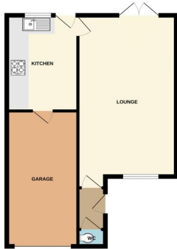
GROUND FLOOR 558 sq.ft. (51.8 sq.m.) approx.